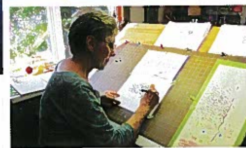
Top left: boats at dock in Trout Lake. Left: the artist at work.

ART IMITATES LIFE ... IN NORTH BAY "North Bay was the model for the small town that [comic strip charac-